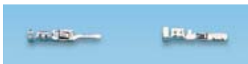
Contacts phosphor bronze, tin plated