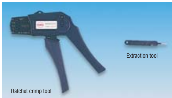
Ratchet crimp tool